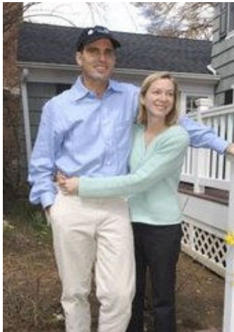
Bob and Lee Woodruff after the accident in Iraq.

Caregiver Connection will keep you up-to-date as this legislation moves through the State House.